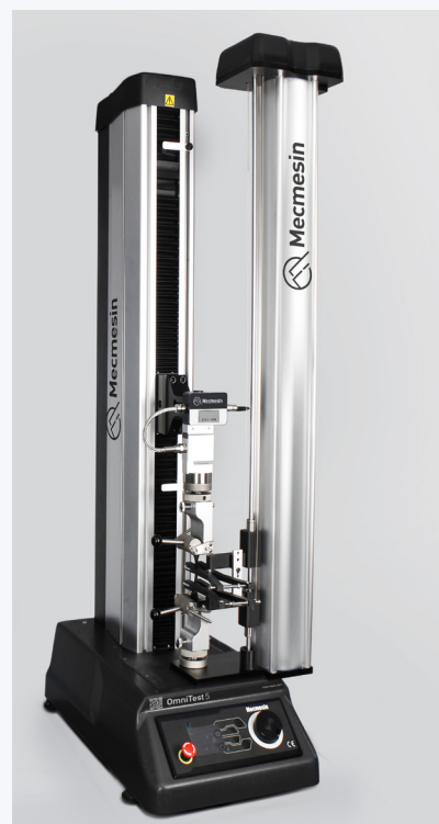
MLTE 700 mounted on OmniTest 5