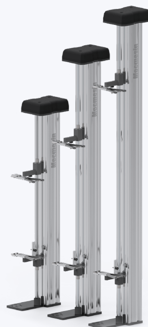
MLTE 700, MLTE 1000 and MLTE 1200

VectorPro is Mecmesin's testing software, used for the programming, control and acquisition of data from OmniTest and MultiTest-dV systems. It captures at high-speed the signals from load cells and extensometers, graphically displays stress/strain data and performs common materials testing calculations with the flexible transfer of raw data and results to Excel™ or a PDF™ report.