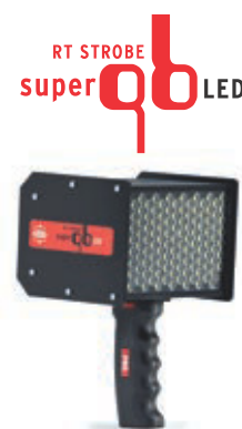
Part number A4-3550

Stroboscope version qbLED (40 LEDs, without laser) or super qbLED (118 LEDs, with laser).