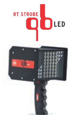
Part number A4-3500