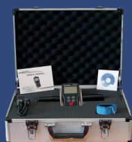
OH&S Force gauge kits