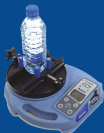
Manually-operated digital cap closure torque tester