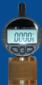
Measuring redraw height of the cap