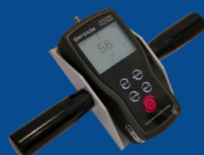
Low cost digital force gauge