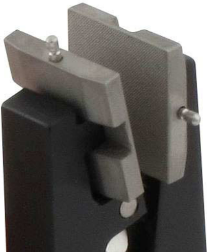
THS205k-BP20 Pyramid jaws 20x20mm