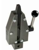
THS7 (wedge grip) Datasheet